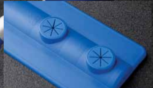
Star Clips For a Snag Fit

PharmaMOP® is designed for cleanroom cleaning SOP's. The light weight, 360 degree rotating and locking mop head give operators excellent control cleaning floors, walls and ceilings. The ultra-light handle , wringer less bucket system and drip resistant mop heads allow operators to efficiently carry out SOP's with improved ergonomics. PharmaMOP® can be used with figure eight, front to back or top to bottom motions and the rotating mop frame enable cleaning of tight spaces. The PharmaMOP® handle and SingleSTEP™ mop heads have been designed to allow for greatly improved cleaning efficiency of soils and residues from difficult to clean textured floors while at the same time allowing ease of mopping. The entire PharmaMOP® system is compatible with steam sterilization and all of the major disinfectants.