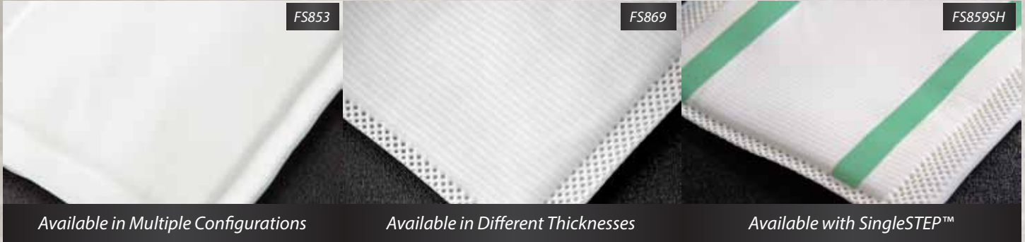
Available in Multiple Configurations